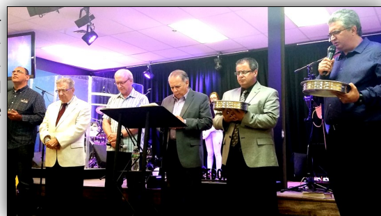
Above: Musicians from Moriah CC lead in worship. Below: Brazilian pastors pray for and pass out the Lord's Supper.